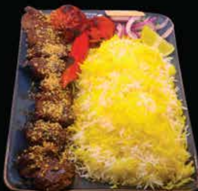
CHANGE THE TORCH €22,90 260 g of lamb skewers, marinated in your mouth, then Pomegranate paste and walnuts