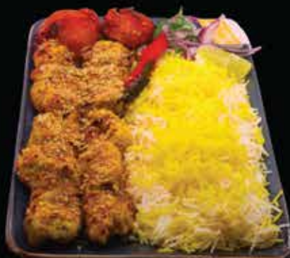
JUJE TORSHKEBAB €19,90 320 g chicken breast fillet then marinated melt-in-your-mouth and Pomegranate paste and walnut (from a skewer)