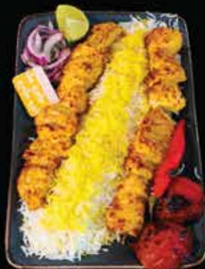
KEBAB €17,90 approx. 320 g of marinated melt-in-your-mouth chicken breast skewers