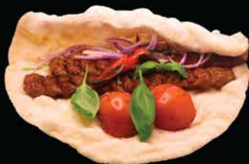
ADANA KEBAB €16 320 g minced beef & lamb, chili pepper parsley, garlic