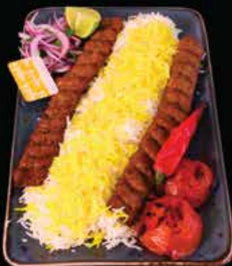
CUBIC €15,90 320 g beef & lamb mince stick