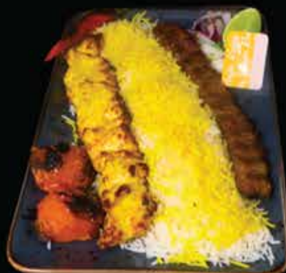
KEBAB MIX €18,90 200 g lamb meat bārbāri bread tomato onion